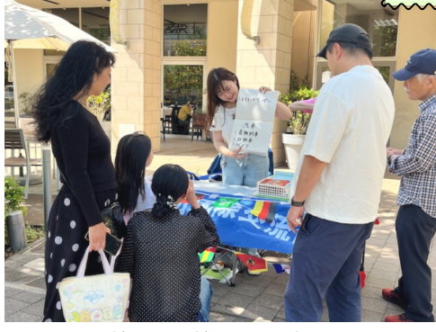
Chinese Character Quiz

PR activity. Since the theme of the event was Mother's Day, we prepared a Mother's Day Quiz from around the world, World Fun Fact Quiz, Chinese Character Quiz, and a flag guessing game. It was sunny, but windy and gusty at times. Nevertheless, many children and families visited the event. Through the fun quizzes and games, we hope that the children learned there are many countries in the world with different cultures and customs, and that the event will be an opportunity for them to open their eyes to the world.